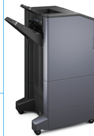
DF-7130 4 4,000 Sheet Finisher 100 Staple / 100 Manual Staple