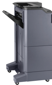
DF-7110 4,000 Sheet Finisher 65 Staple / 65 Manual Staple