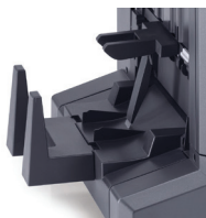
BF-730 Booklet / Tri-fold Unit