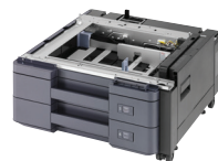
PF-7100 2 x 500 Sheet Tray (Ledger)