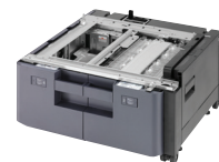
PF-7110 2 x 1,500 Sheet Tray (Letter)