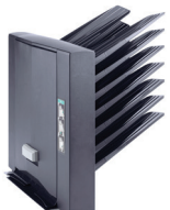
MT-730 (B) 7 Bin Mailbox