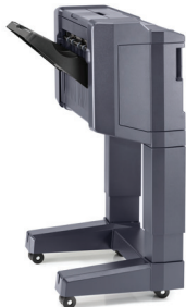
DF-7120 1,000 Sheet Finisher 50 Staple